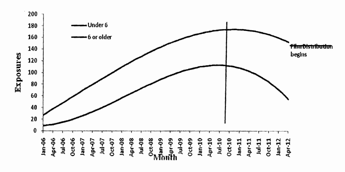
Figure 4: Trend Line of exposures to Suboxone over Time

FDA approved Suboxone Film in August of 2010. In September of that year, RBP began distribution of Suboxone film with unit-dose child-resistant packaging.<sup>58</sup> By 2011, data from AAPCC had demonstrated a precipitous decline in the number of pediatric exposures to buprenorphine products, even from 2009 levels (Figure 4).