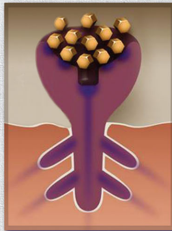
Partial Agonist Opioid (Buprenorphine). Imperfect Fit. Less intrinsic activity (opiate effect).

of Buprenorphine at the \mu -receptor, the partial agonist displaces full agonist opioids from the \mu -receptors, but activates the receptor to a lesser degree than full agonists which results in a net decrease in agonist effect, thereby precipitating withdrawal. 1